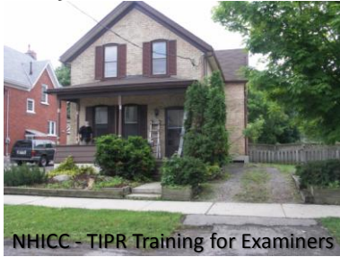
NHICC - TIPR Training for Examiners